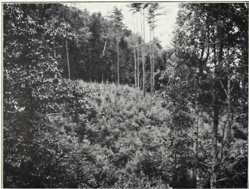
FIG. 2.—WHITE PINE REPRODUCTION, FILLING A CUT-OVER AND BURNED SPACE IN A HARDWOOD FOREST.

[This resulted in an abundant reproduction of both white pine and white ash. Because of its slow growth when very young the pine has little chance of success in competition with the ash, and the latter should be favored.]